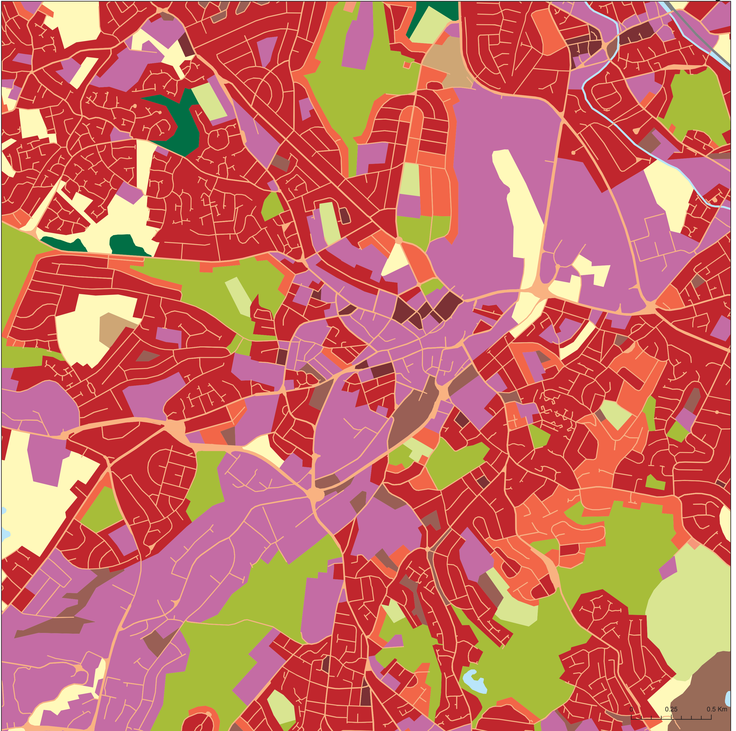
Larger Urban Zone: Birmingham