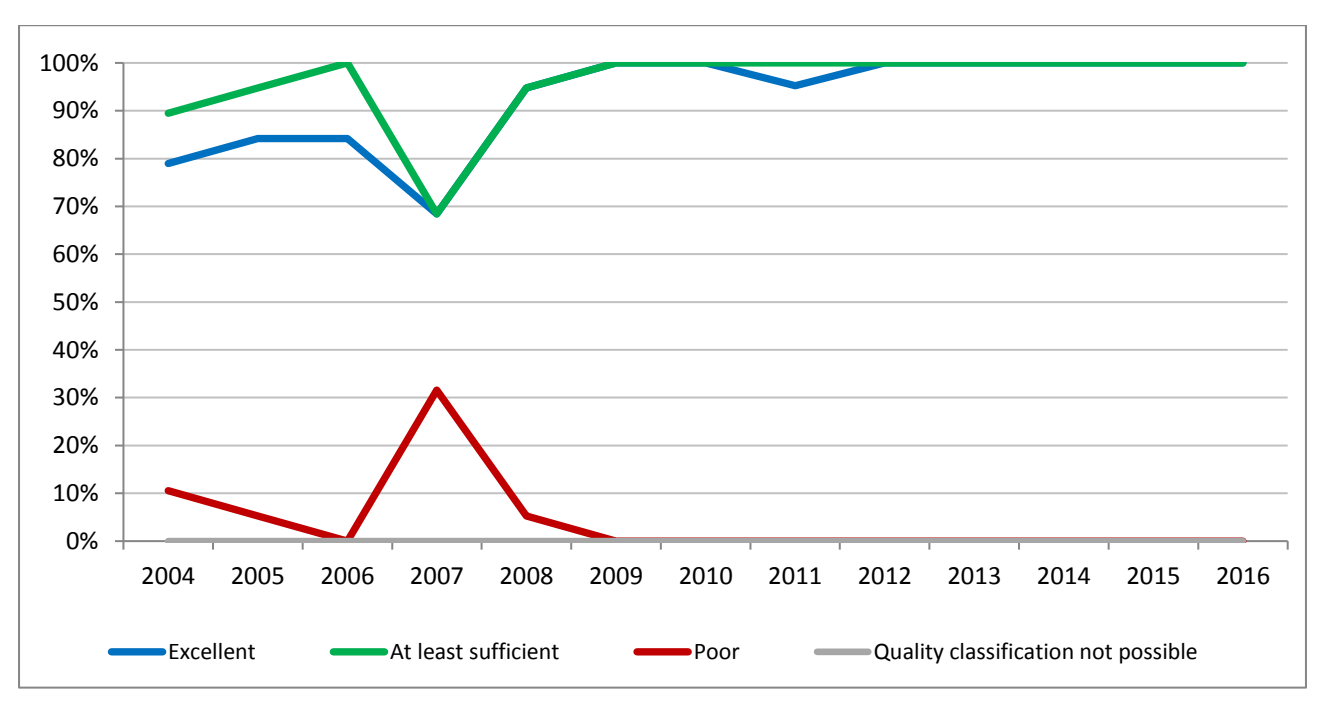
Figure 1: Coastal bathing water quality trend in Slovenia. Note: the "At least sufficient" class also includes bathing waters of "Excellent" quality class, the sum of shares is therefore not 100%.

In Slovenia, all existing coastal bathing waters met at least sufficient water quality standards in 2016. See Appendix 1 for numeric data.