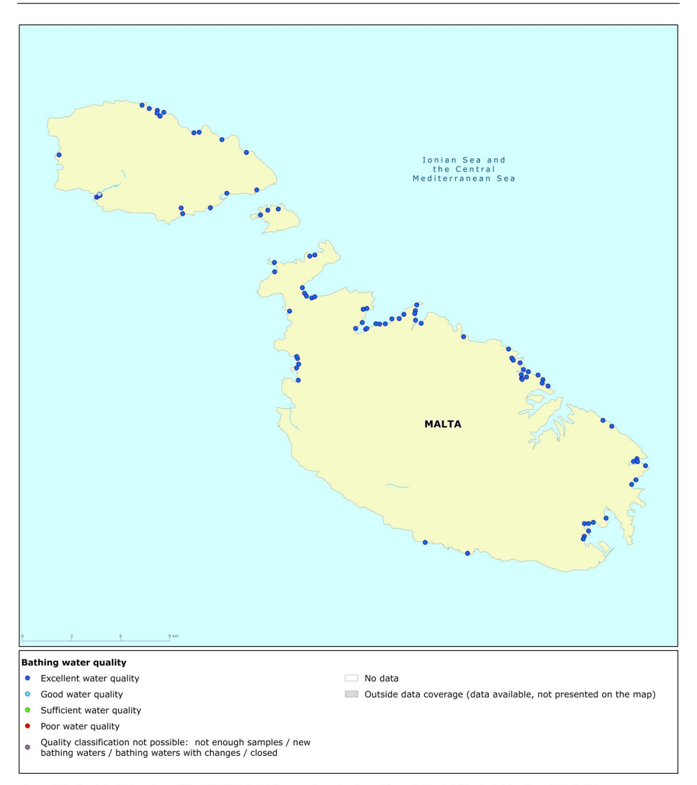
Map 1: Bathing waters reported during the 2016 bathing season in Malta