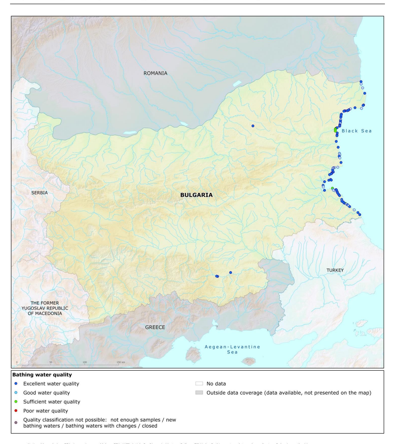
Map 1: Bathing waters reported during the 2016 bathing season in Bulgaria