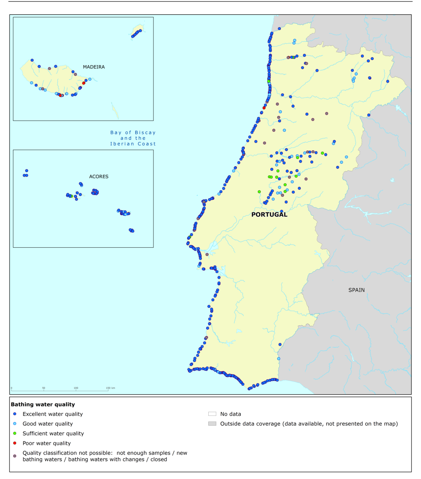
Map 1: Bathing waters reported during the 2014 bathing season in Portugal