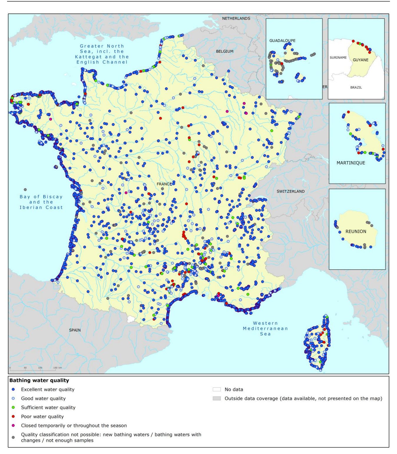
Map 1: Bathing waters reported during the 2013 bathing season in France