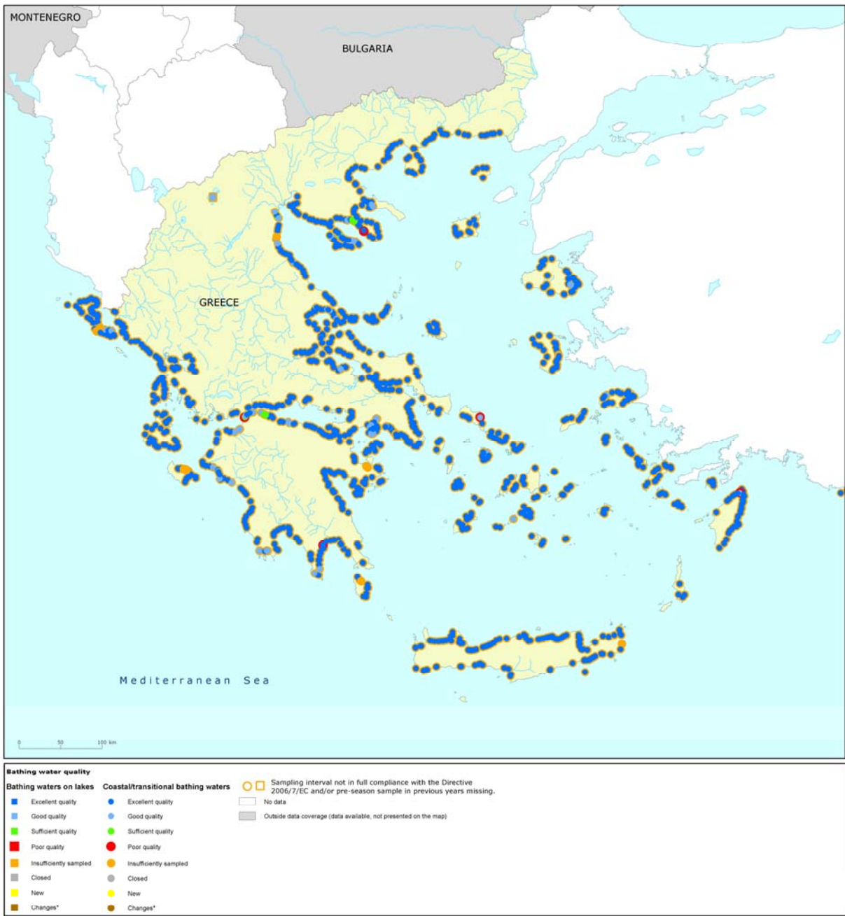
Map 1: Bathing waters reported during the 2011 bathing season in Greece