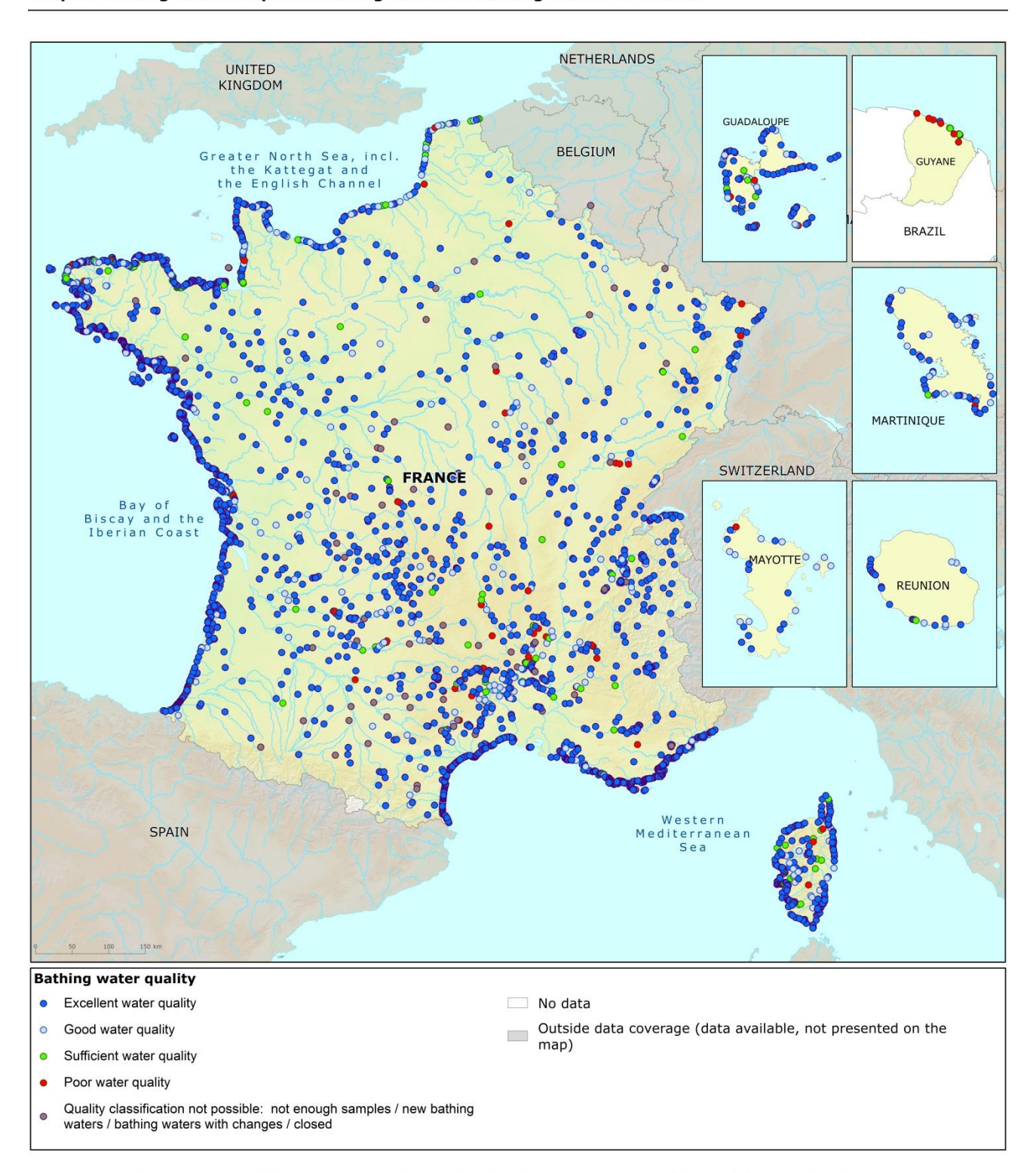
Map 1: Bathing waters reported during the 2016 bathing season in France