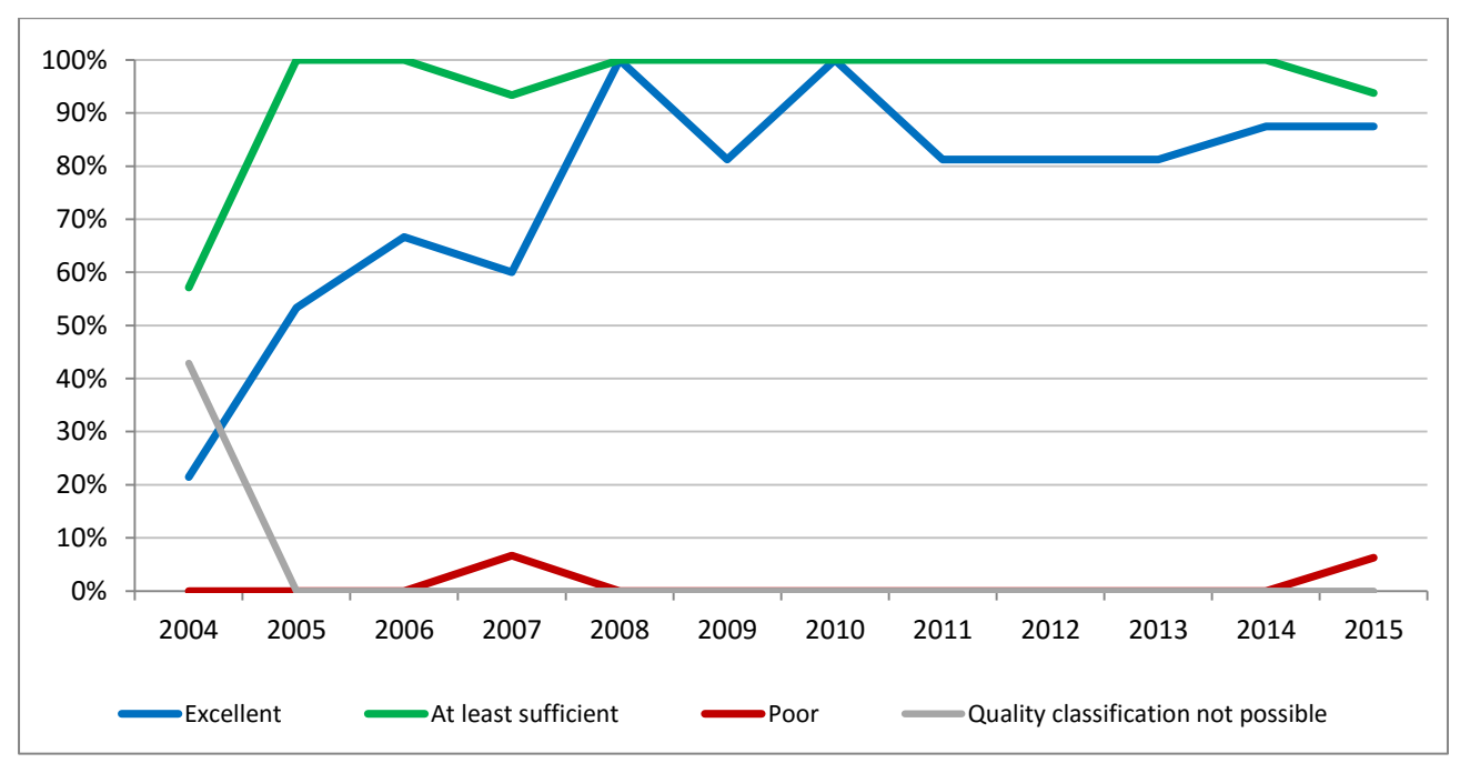
Figure 1: Coastal bathing water quality trend in Lithuania. Note: the "At least sufficient" class also includes bathing waters of "Excellent" quality class, the sum of shares is therefore not 100%.

In Lithuania, 93.8% of all existing coastal bathing waters met at least sufficient water quality standards in 2015. See Appendix 1 for numeric data.