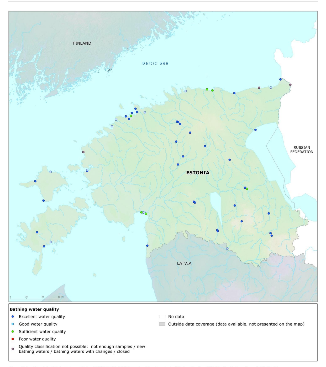
Map 1: Bathing waters reported during the 2015 bathing season in Estonia