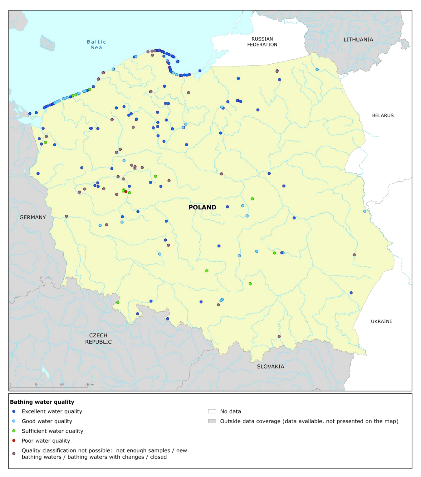
Map 1: Bathing waters reported during the 2014 bathing season in Poland