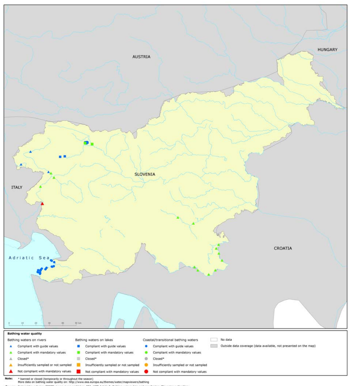
Map 1: Bathing waters reported during the 2009 bathing season in Slovenia