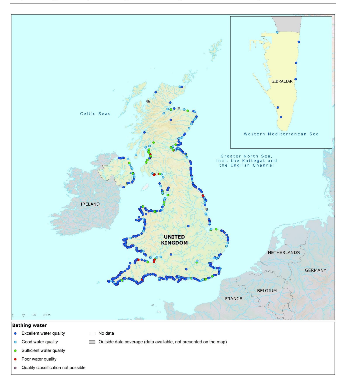
Map 1: Bathing waters reported during the 2019 bathing season in the United Kingdom