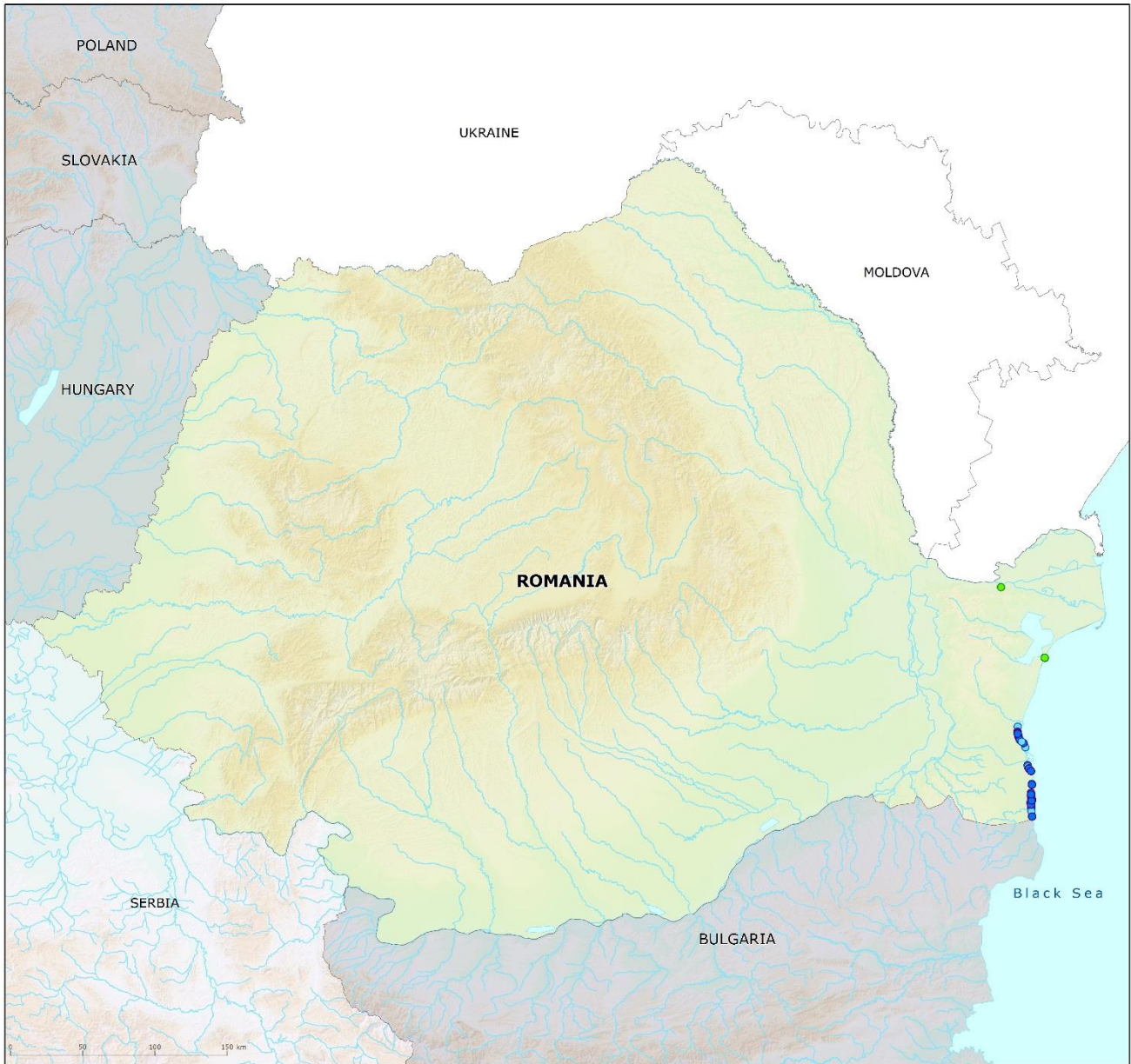
Map 1: Bathing waters reported during the 2019 bathing season in Romania