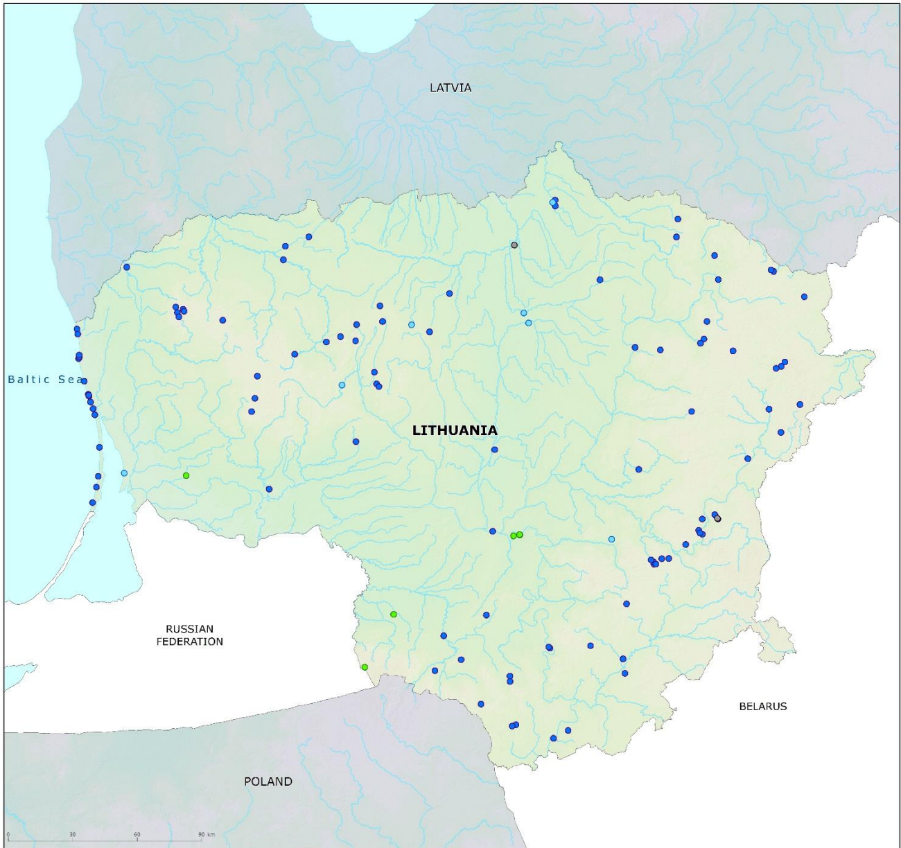
Map 1: Bathing waters reported during the 2019 bathing season in Lithuania