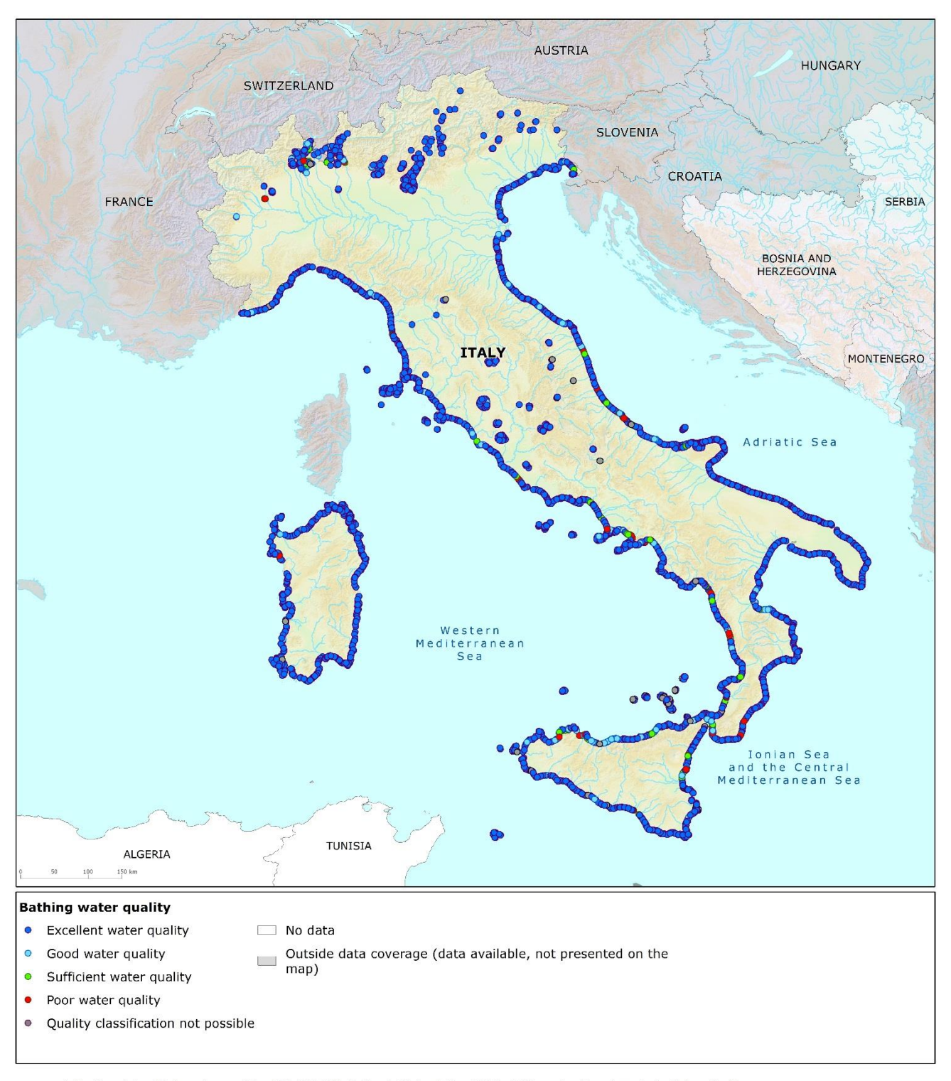
Map 1: Bathing waters reported during the 2019 bathing season in Italy