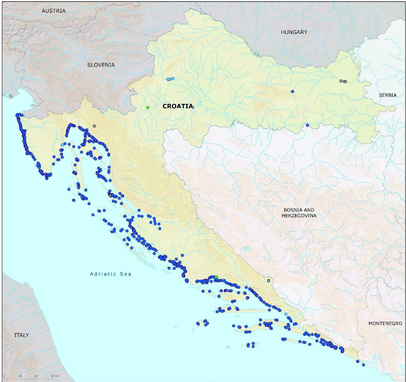
Map 1: Bathing waters reported during the 2019 bathing season in Croatia