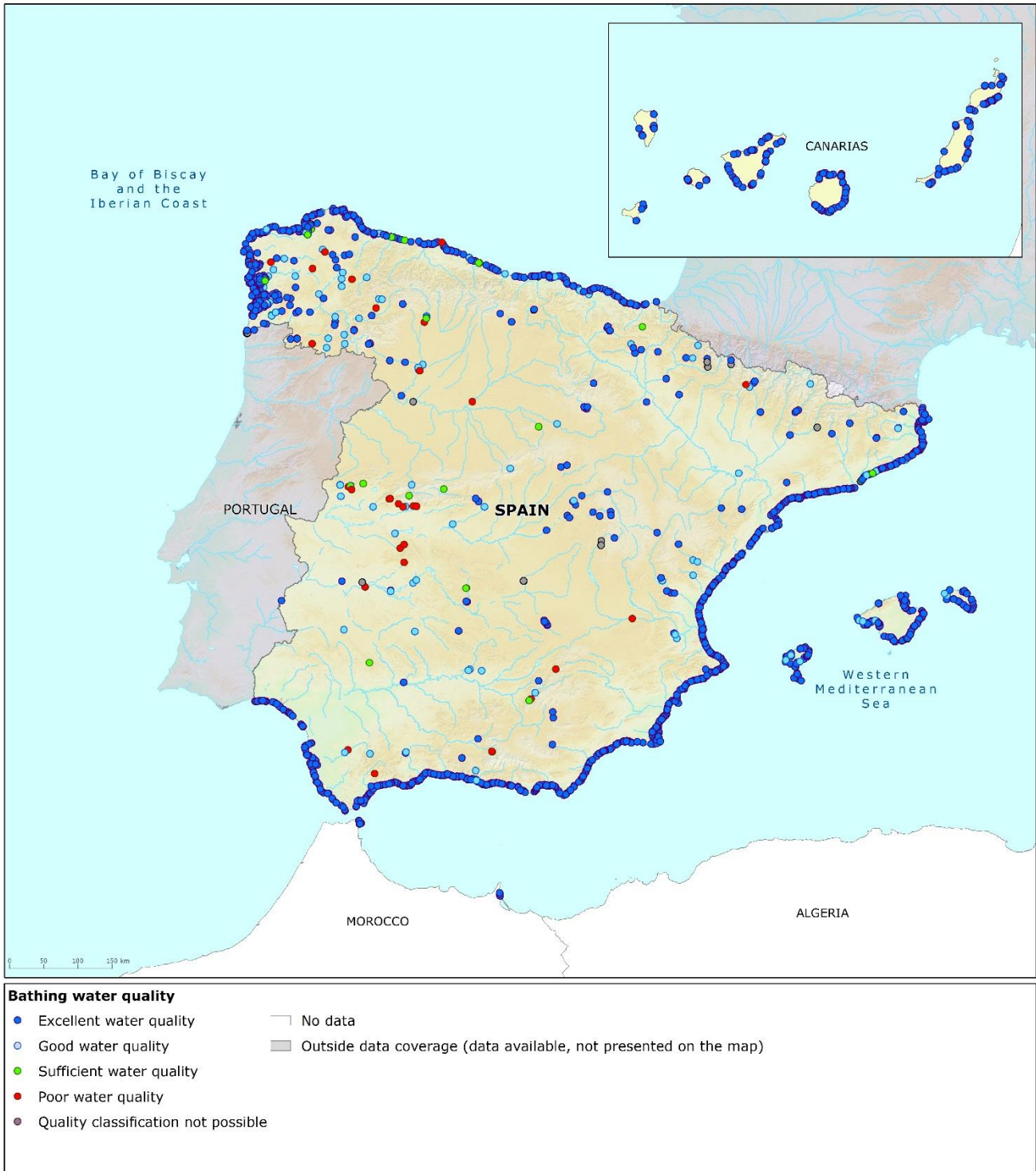
Map 1: Bathing waters reported during the 2019 bathing season in Spain