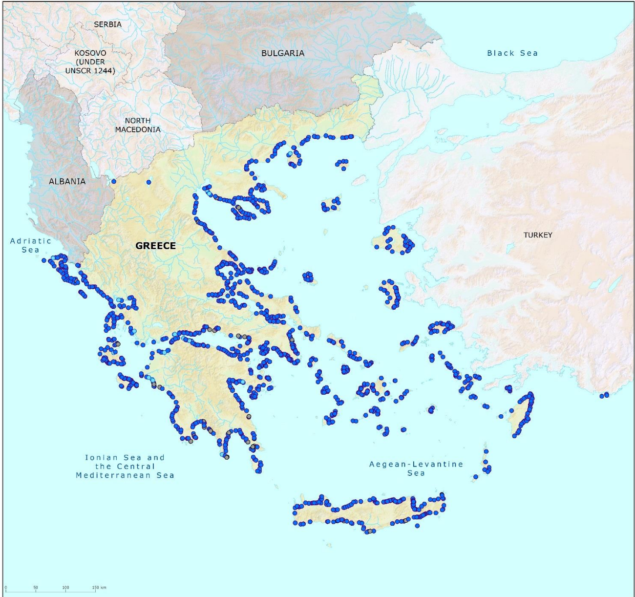
Map 1: Bathing waters reported during the 2019 bathing season in Greece