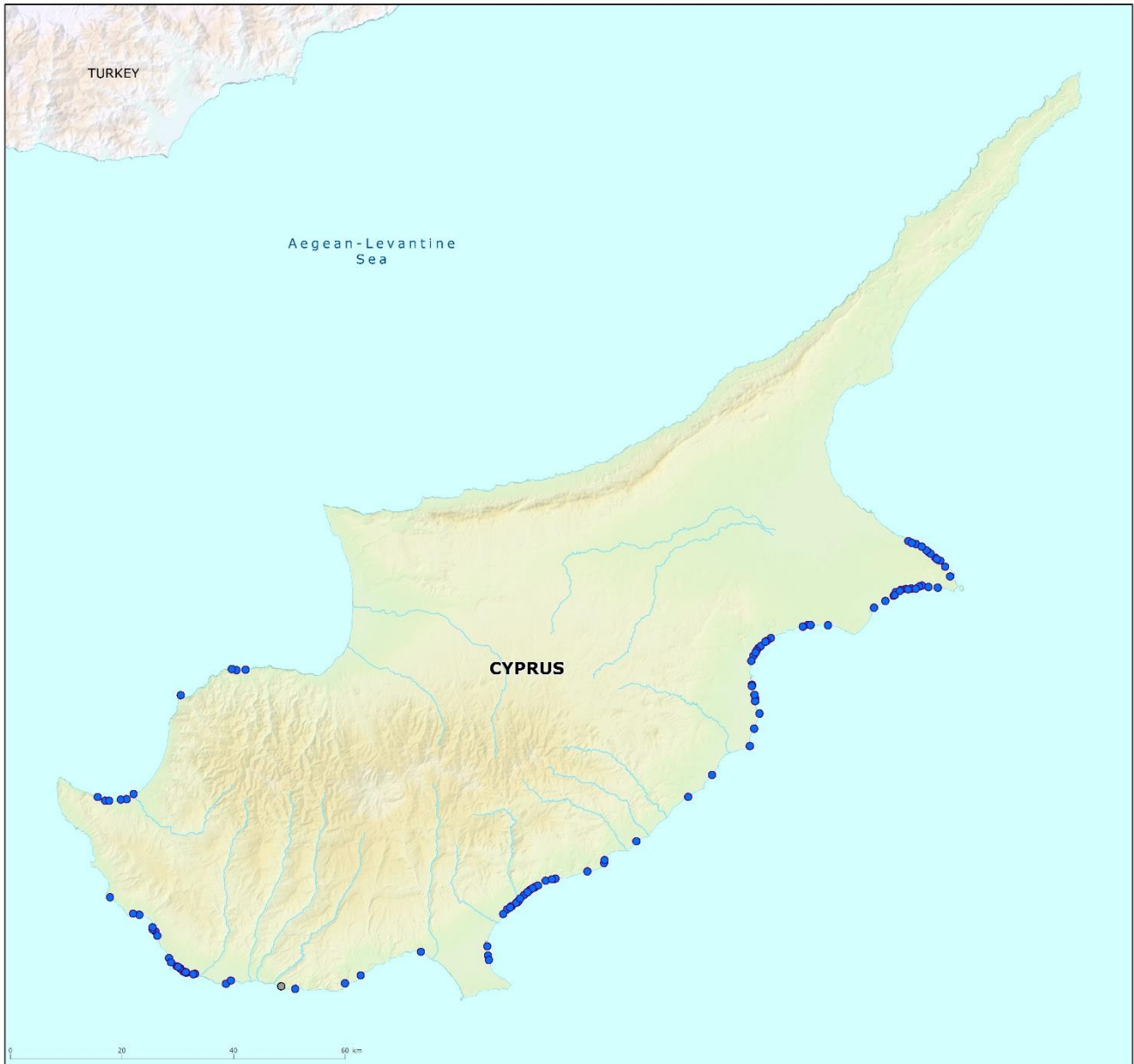
Map 1: Bathing waters reported during the 2019 bathing season in Cyprus