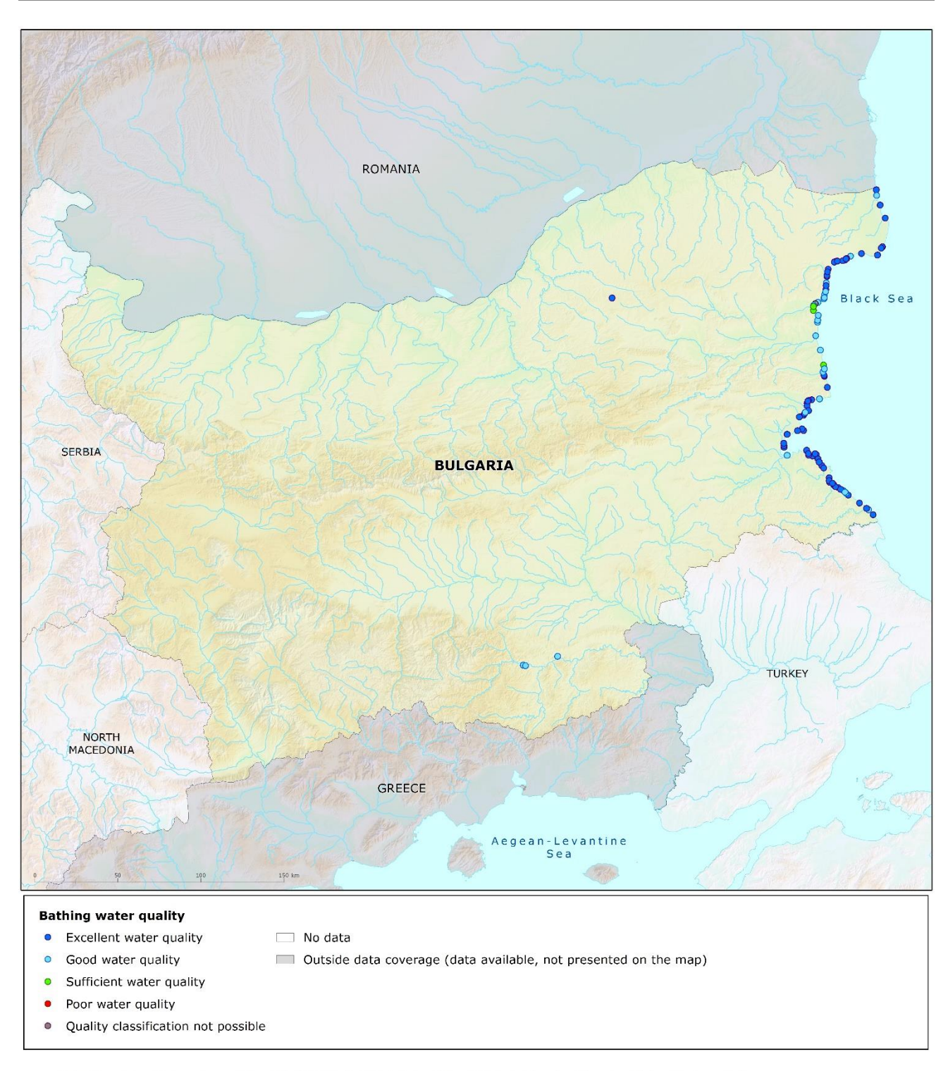
Map 1: Bathing waters reported during the 2019 bathing season in Bulgaria