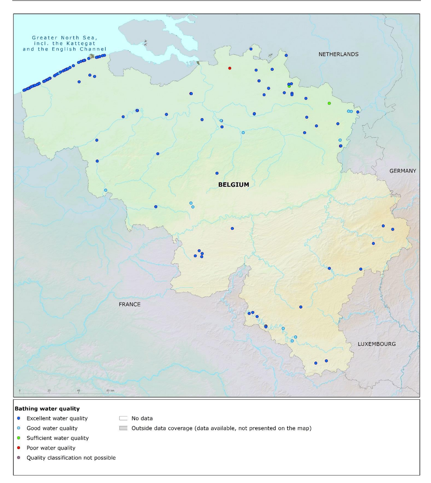
Map 1: Bathing waters reported during the 2019 bathing season in Belgium