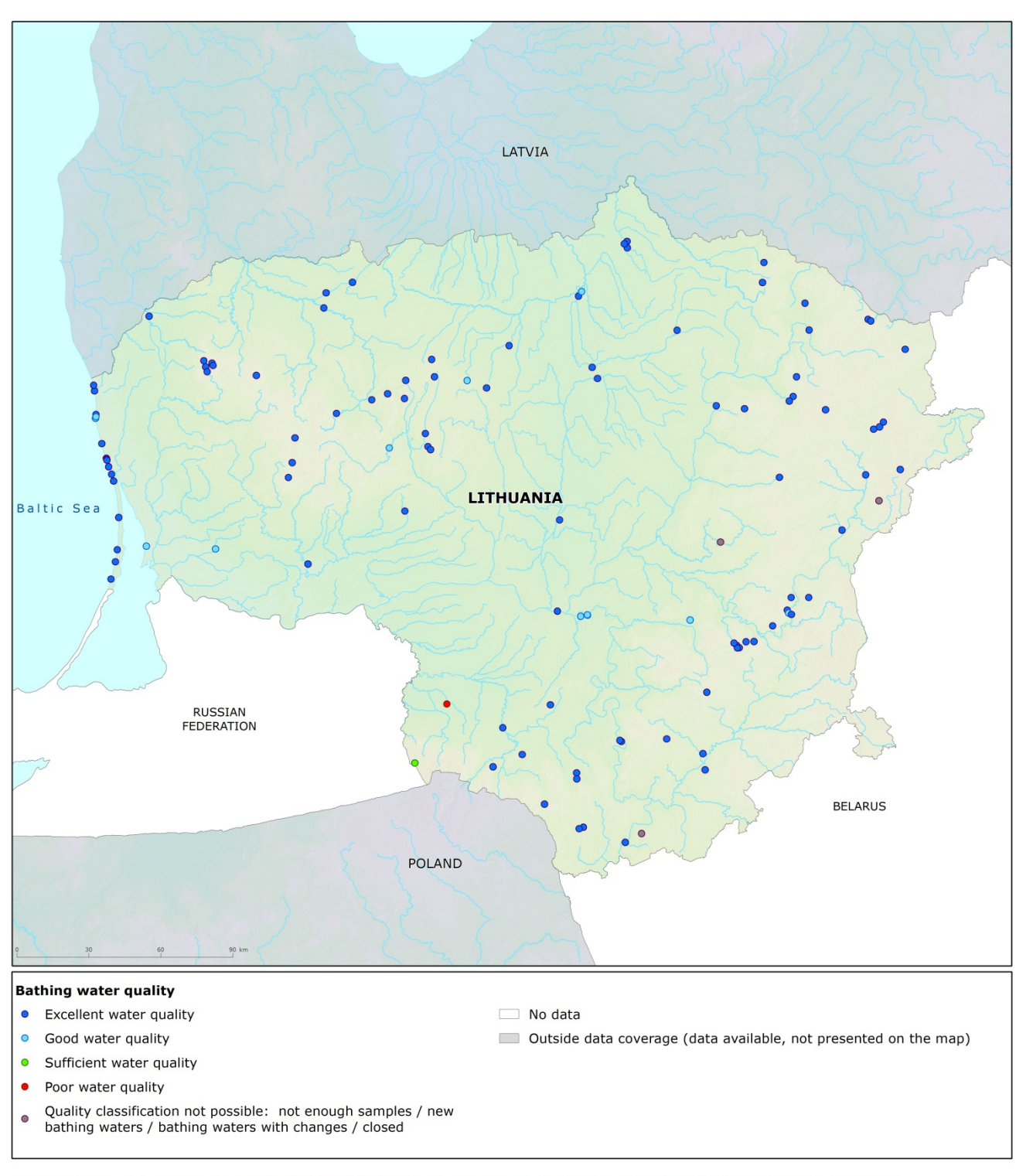
Map 1: Bathing waters reported during the 2017 bathing season in Lithuania