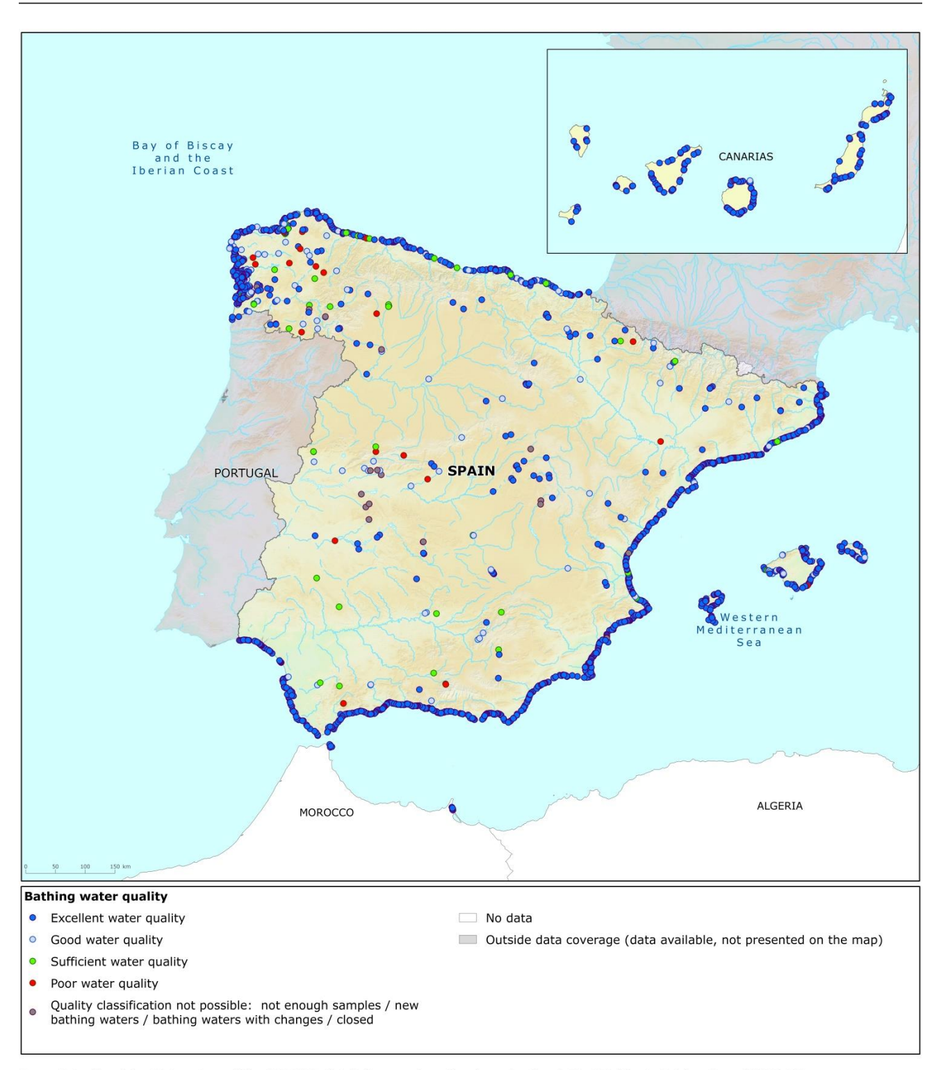
Map 1: Bathing waters reported during the 2016 bathing season in Spain