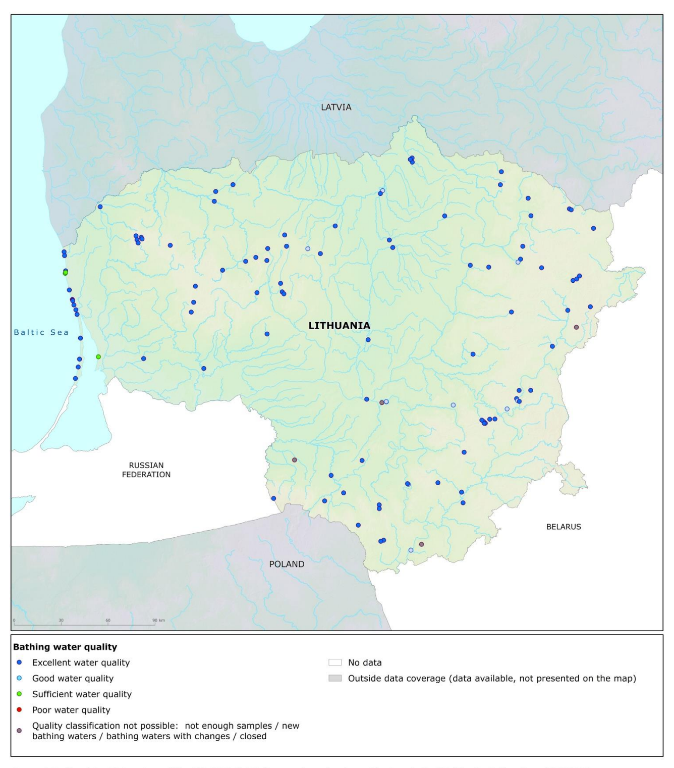
Map 1: Bathing waters reported during the 2016 bathing season in Lithuania