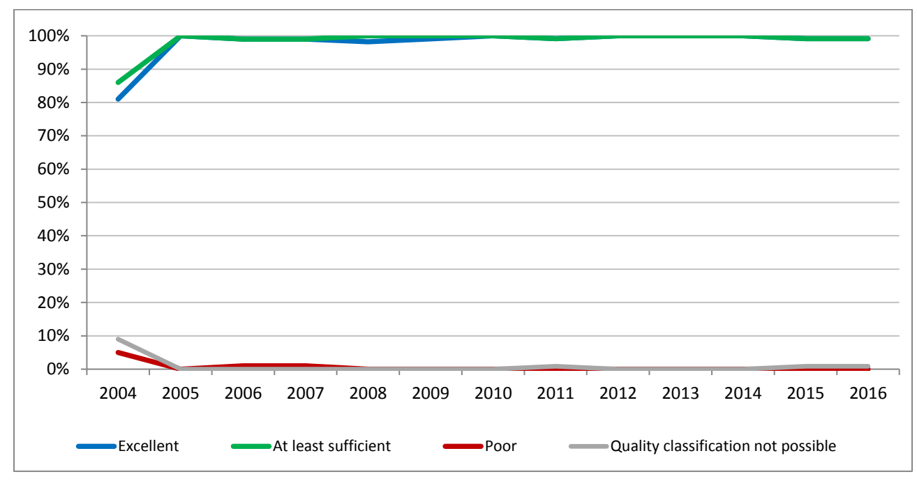
Figure 1: Coastal bathing water quality trend in Cyprus. Note: the "At least sufficient" class also includes bathing waters of "Excellent" quality class, the sum of shares is therefore not 100%.

In Cyprus, 99.1% of all existing coastal bathing waters met at least sufficient water quality standards in 2016. See Appendix 1 for numeric data.