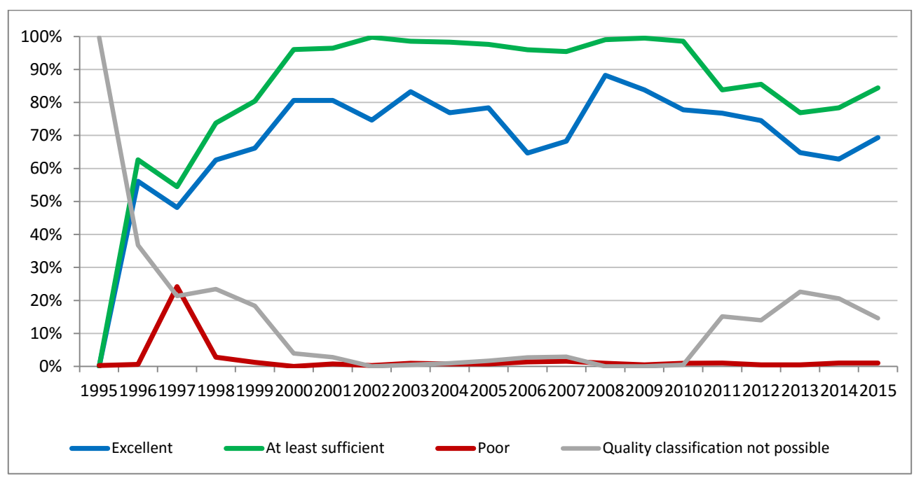
Figure 2: Inland bathing water quality trend in Sweden. Note: the "At least sufficient" class also includes bathing waters of "Excellent" quality class, the sum of shares is therefore not 100%.

84.4% of all existing inland bathing waters were of at least sufficient water quality in 2015. See Appendix 1 for numeric data.