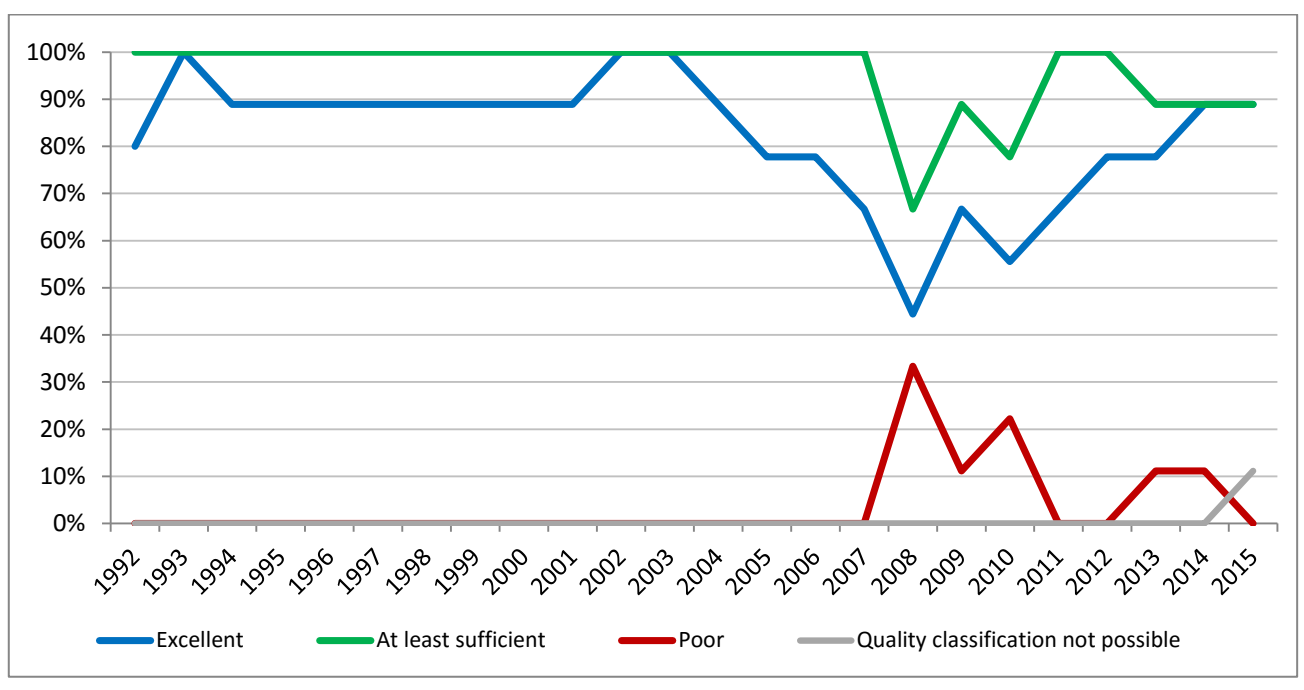
Figure 2: Inland bathing water quality trend in Ireland. Note: the "At least sufficient" class also includes bathing waters of "Excellent" quality class, the sum of shares is therefore not 100%.

88.9% of all existing inland bathing waters were of at least sufficient water quality in 2015. See Appendix 1 for numeric data.