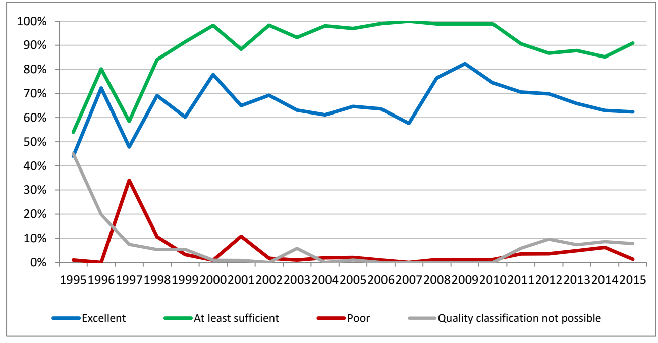
Figure 1: Coastal bathing water quality trend in Finland. Note: the "At least sufficient" class also includes bathing waters of "Excellent" quality class, the sum of shares is therefore not 100%.

In Finland, 90.9% of all existing coastal bathing waters met at least sufficient water quality standards in 2015. See Appendix 1 for numeric data.