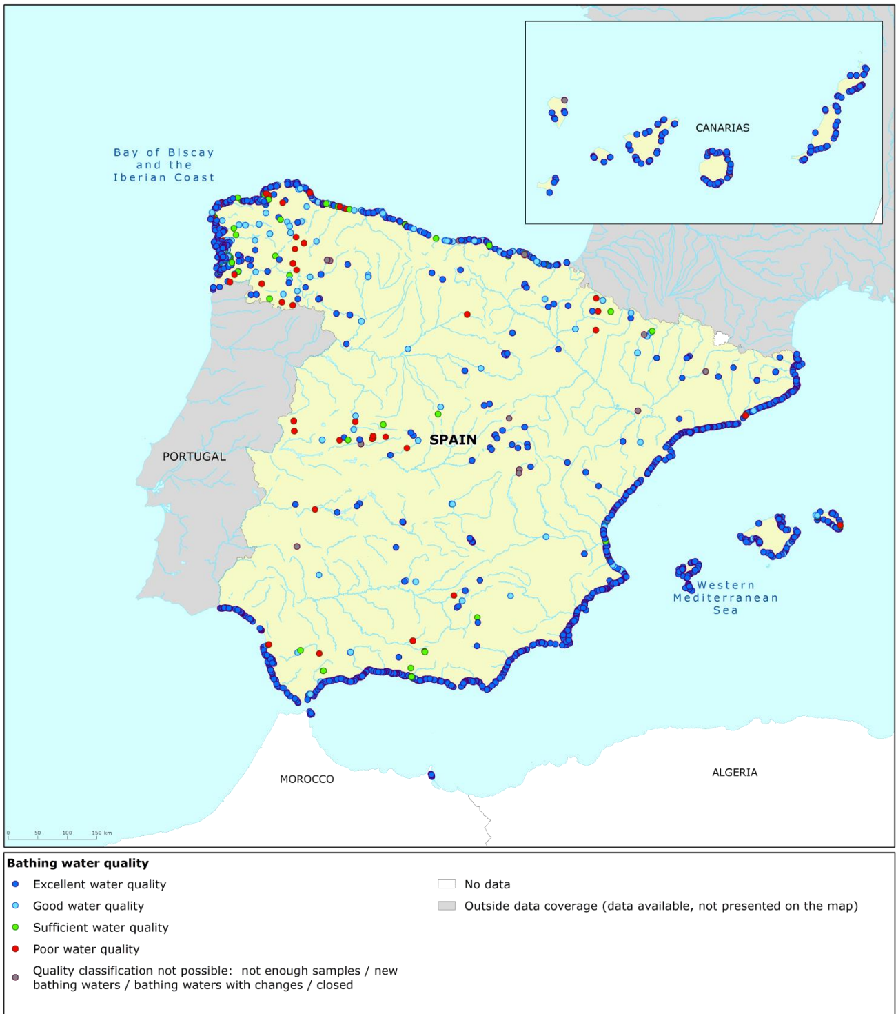
Map 1: Bathing waters reported during the 2014 bathing season in Spain