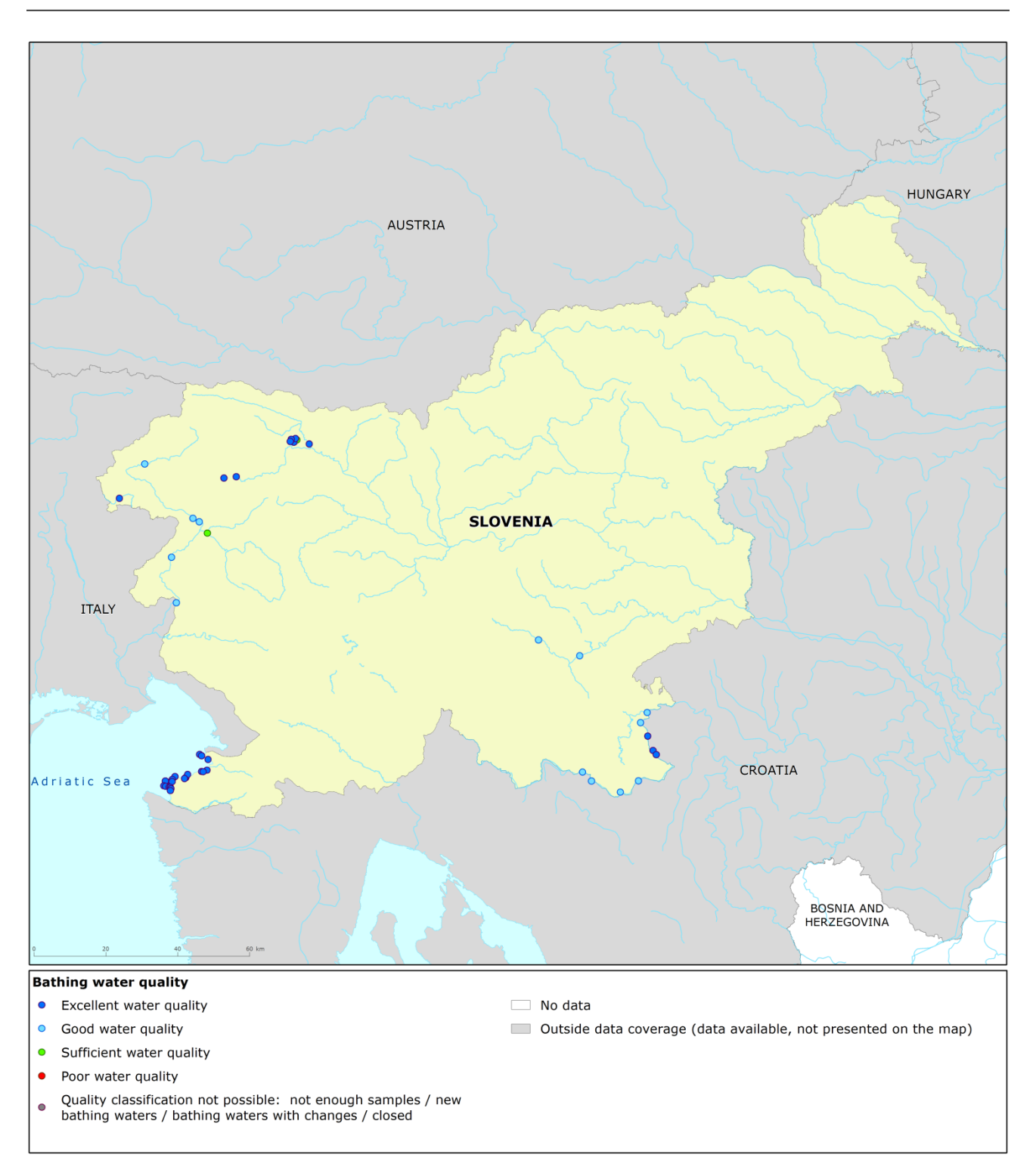
Map 1: Bathing waters reported during the 2014 bathing season in Slovenia