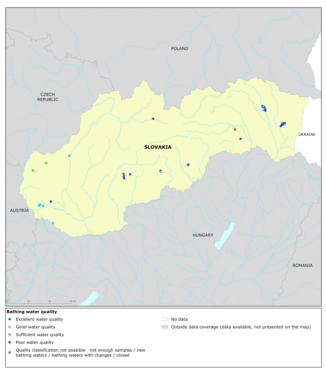
Map 1: Bathing waters reported during the 2014 bathing season in Slovakia