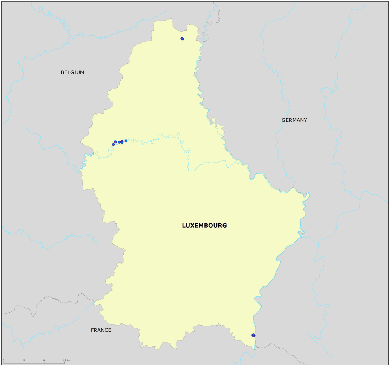
Map 1: Bathing waters reported during the 2014 bathing season in Luxemburg