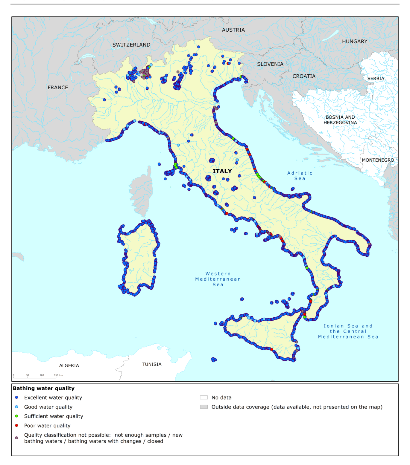
Map 1: Bathing waters reported during the 2014 bathing season in Italy