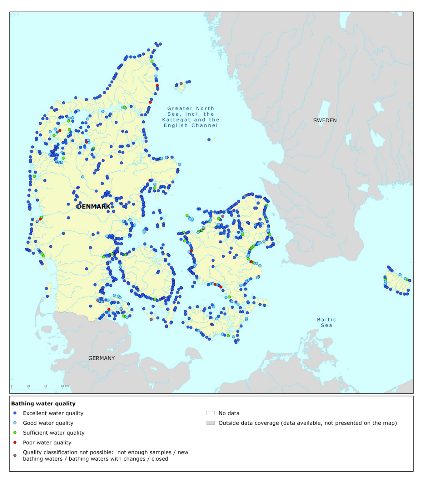
Map 1: Bathing waters reported during the 2014 bathing season in Denmark