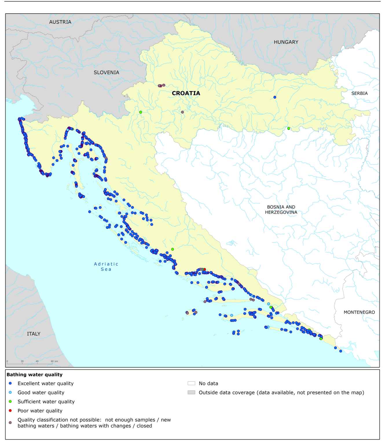
Map 1: Bathing waters reported during the 2014 bathing season in Croatia