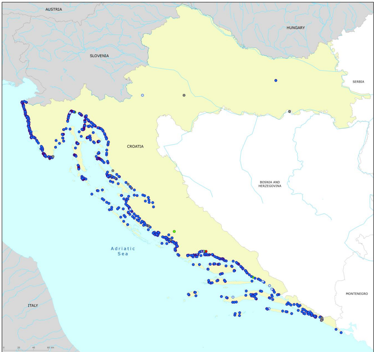
Map 1: Bathing waters reported during the 2013 bathing season in Croatia