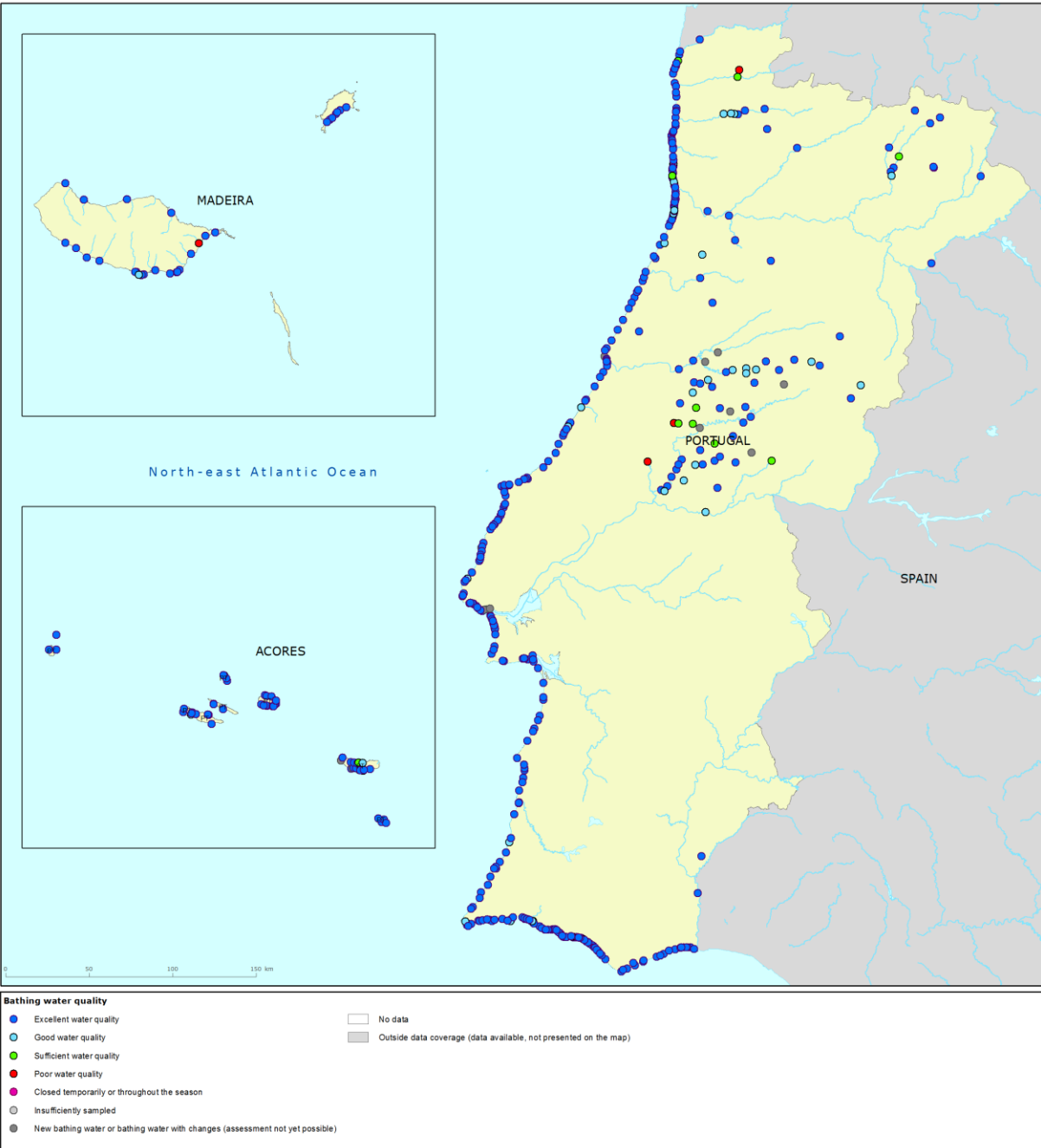
Map 1: Bathing waters reported during the 2012 bathing season in Portugal