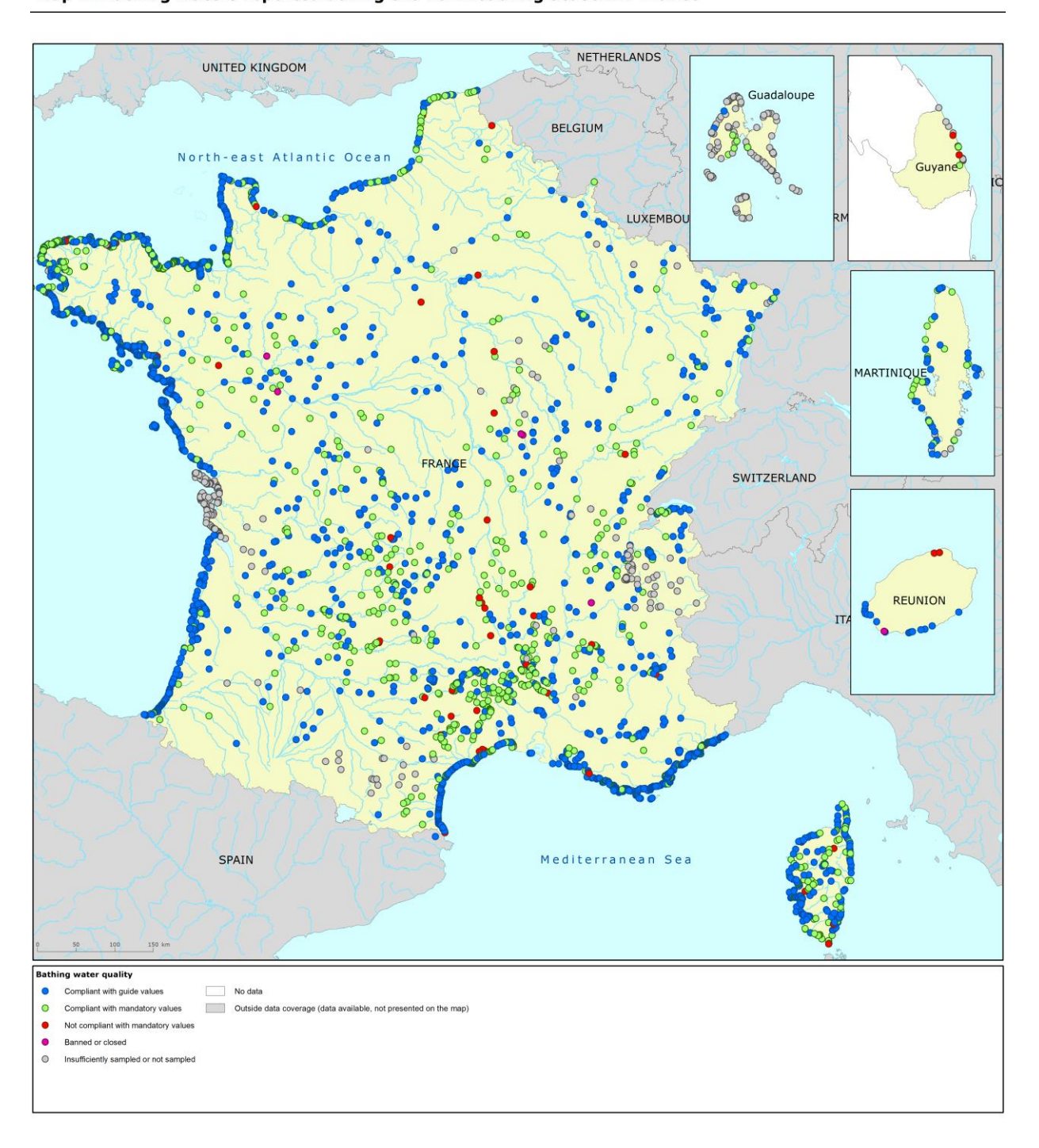
Map 1: Bathing waters reported during the 2012 bathing season in France