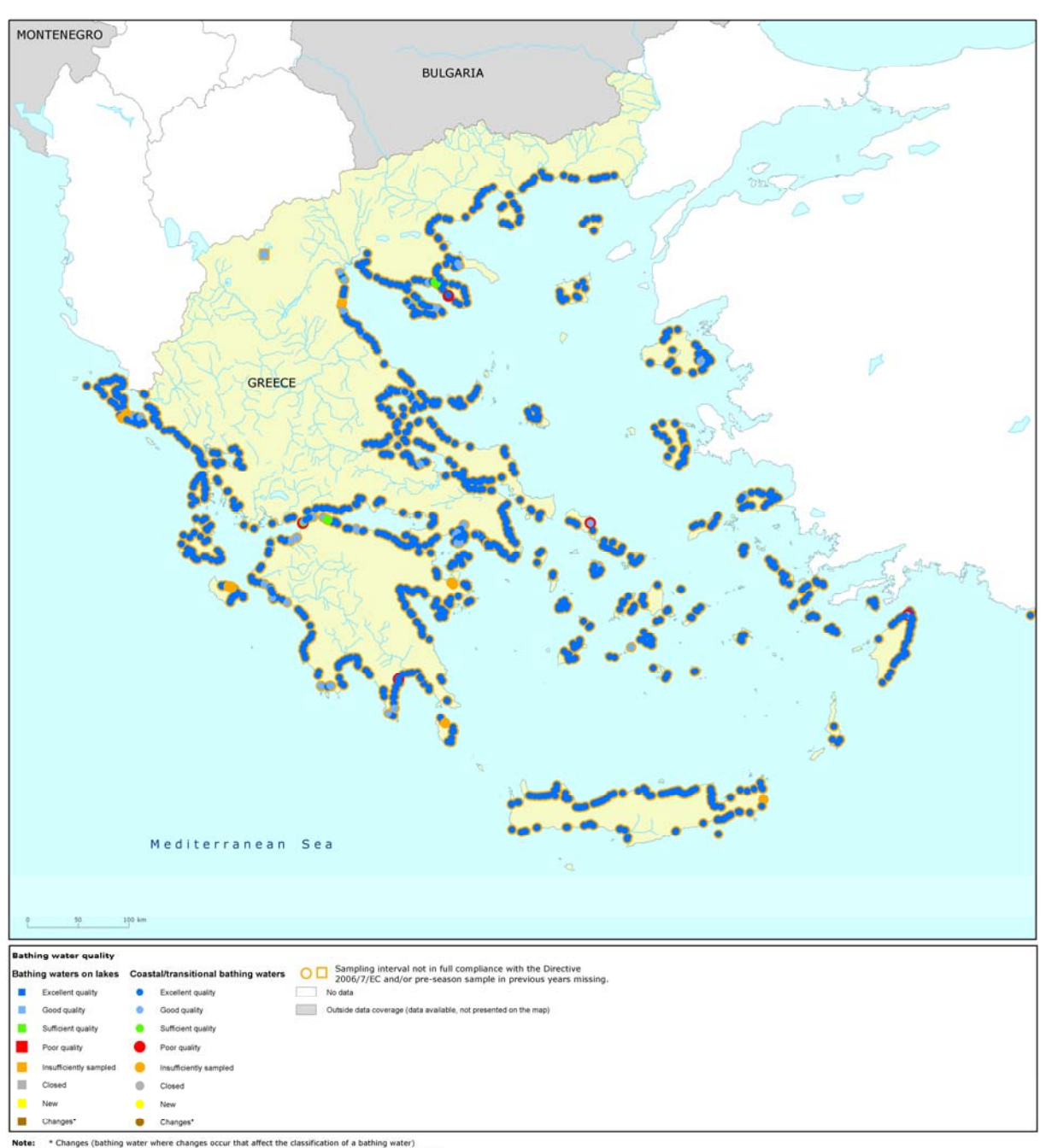
Map 1: Bathing waters reported during the 2011 bathing season in Greece