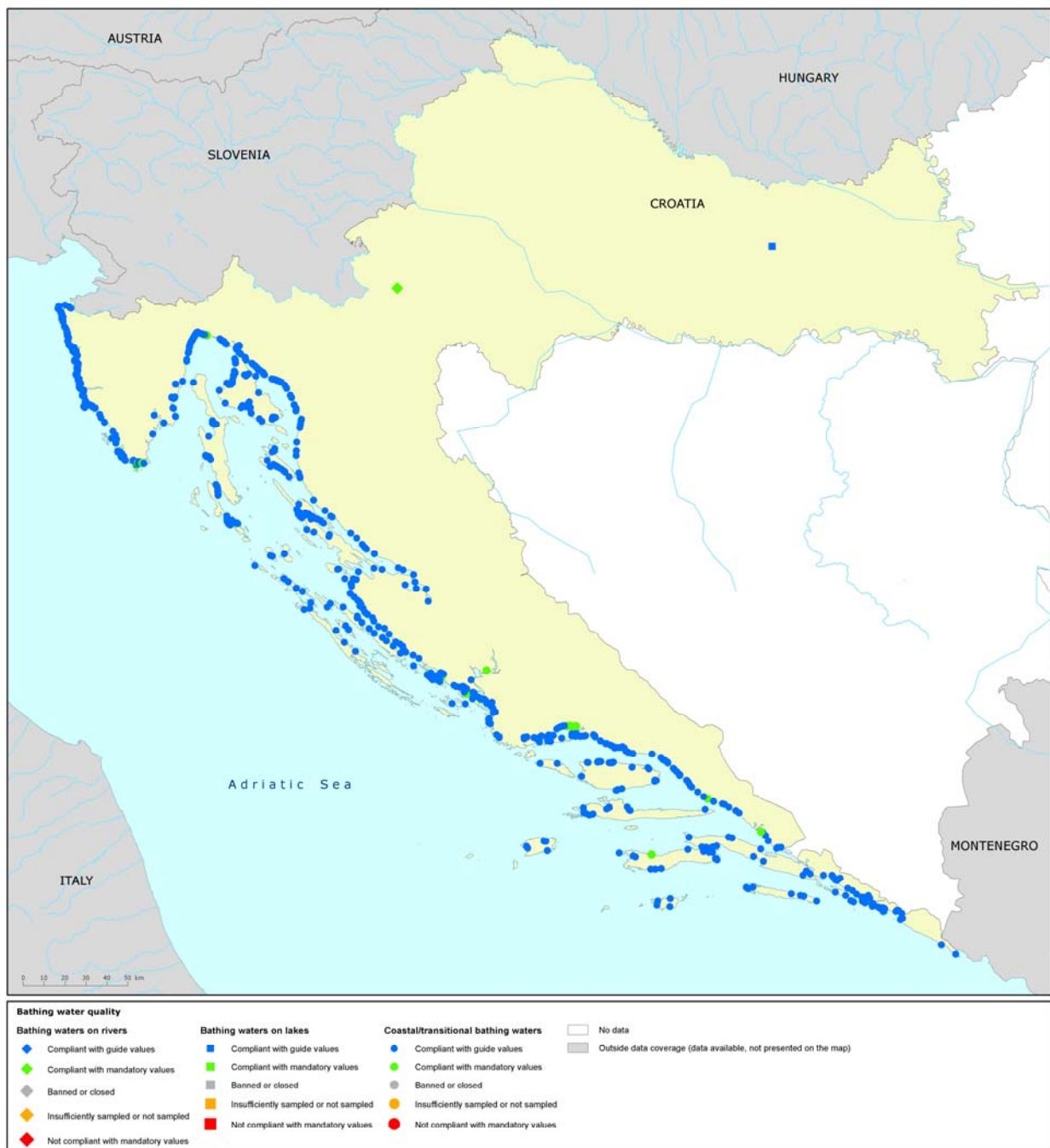
Map 1: Bathing waters reported during the 2011 bathing season in Croatia