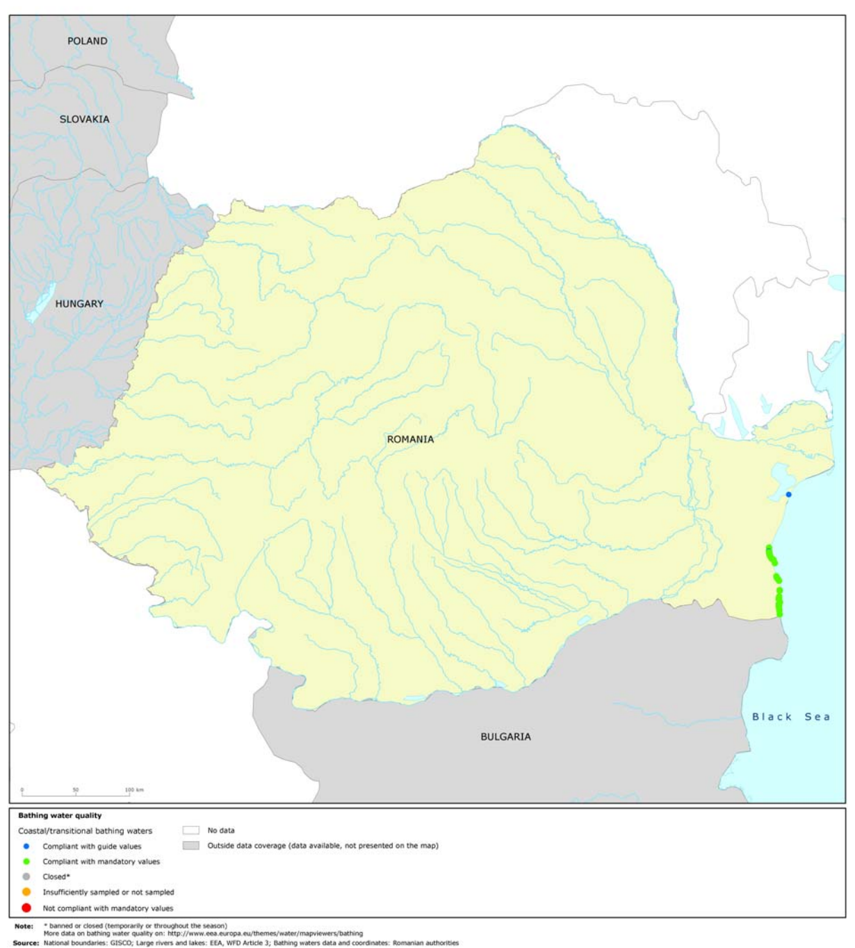
Map 1: Bathing waters reported during the 2009 bathing season in Romania