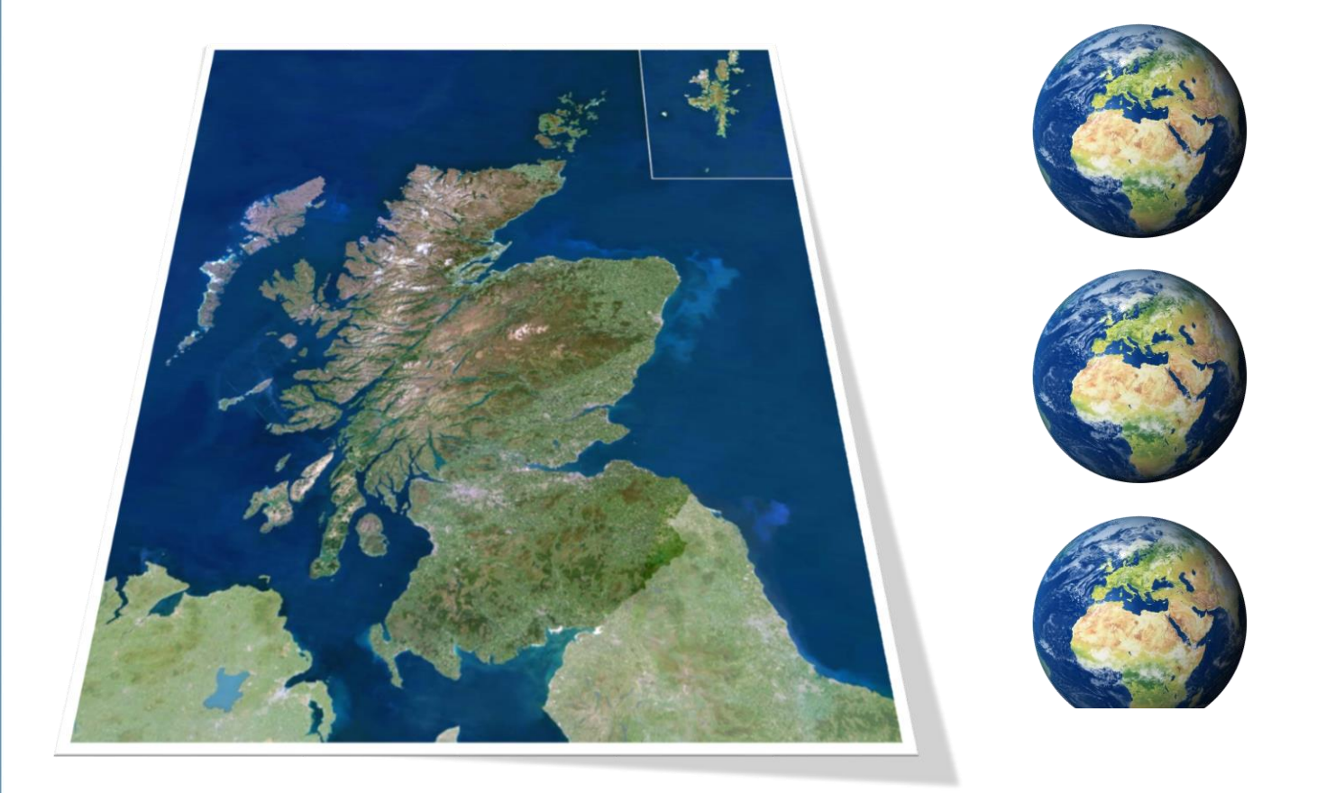
Todays problems are more complex and interrelated