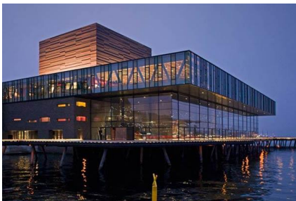
Royal Danish Playhouse

A networking dinner will take place at the Royal Danish Playhouse (in Danish: Skuespilhuset), within a 10-minute walk from the EEA, with an arrival by 18.45 for dinner to be served at 19.15. Please note: participation in the dinner is only possible if you signed up through the registration form. Remember to bring your event badge. Those who have registered special dietary requirements will be catered for. Dinner dress code: smart casual.