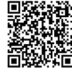
National monitoring, reporting and evaluation of climate change adaptation in Europe (EEA Technical Report 20/2015)