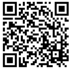
Urban adaptation to climate change in Europe 2016 (EEA Report 12/2016)