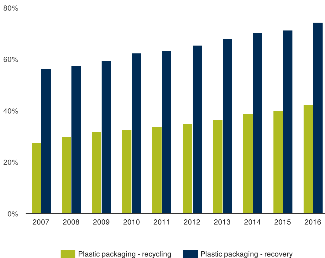
Figure 2. Plastic packaging recycling and recovery in the EU-28

The figure represents the recycling (green bars) and recovery (blue bars) rates of plastic packaging waste in the EU-28.