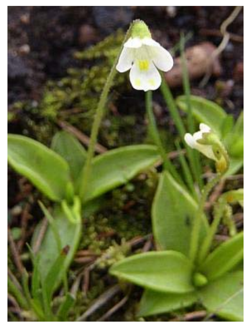
Pinguicula alpina, the alpine butterwort is a glacial relict species in waterlogged meadows in parts of the Pannonian region.

Temporarily waterlogged meadows need management for persistence. Several types of Molinia -meadows form this group. The plant communities here are of particular interest in late summer, when many of the more typical species are flowering: devil's-bit scabious Succisa pratensis and superb pink Dianthus superbus . These habitats have to a large extent deteriorated, especially over the last 25 years.