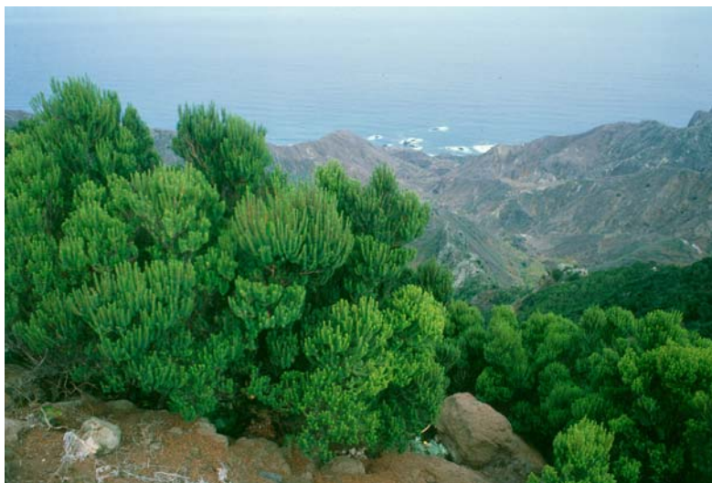
Erica arborea , tree heath, is a common species in the dryer uplands of the Macaronesian region.

At dryer places and altitudinally above the laurisilva forest a pine forest belt is found. Here the endemic Canary pine ( Pinus canariensis ) grows together with tree heath ( Erica arborea ), Cistus -species and the endemic escabon ( Chamaecystus proliferus ). The higher part of this belt hosts the endemic Juniperus cedrus .