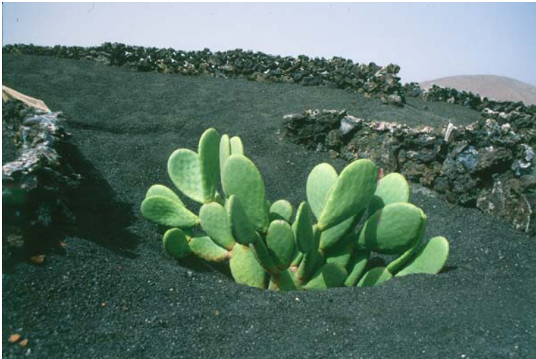
Opuntia sp. growing in volcanic sand.

The arid regions of Europe have mainly arisen due to human activities. Original vegetation has been cleared, leaving the light soil exposed to wind and sunlight. In the Canary Islands, the desertification was enhanced by a lowered water table due to water extraction or tapping springs. The resulting halophytic vegetation has been overgrazed by livestock (especially goats) leaving the soil bare.