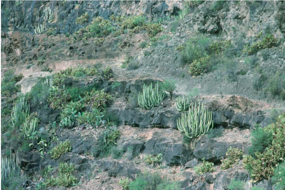
View of a Macaronesian dry habitat with shrub vegetation.

The Azores, strongly influenced by its oceanic location, are climatologically different from Madeira and Canary Islands with high precipitation and high humidity. Precipitation shows a prominent east-west gradient with substantially higher annual rainfall in the westerly islands.