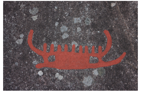
Photo: Njord quality label inspired by the rock carvings at Tanum © Gordon McInnes