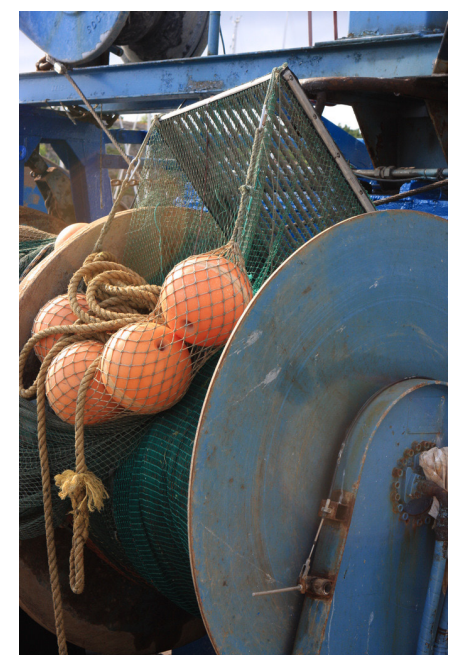
Photo: Ferder fishing gear showing aluminium grid designed to reduce by-catch © Gordon McInnes

The fishermen have then organised courses for local researchers and politicians to inform them on their experience, life-style, and the fish and sea-food they were currently fishing. The fishermen also take the researchers and politicians on fishing trips to show how shrimp are caught with the less damaging