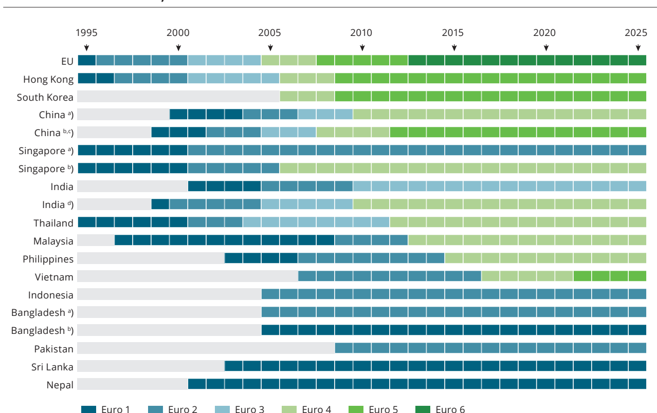
Figure 11.3 Adoption of the EU's Euro emissions standards for cars and vans in Asian countries, 1995–2025